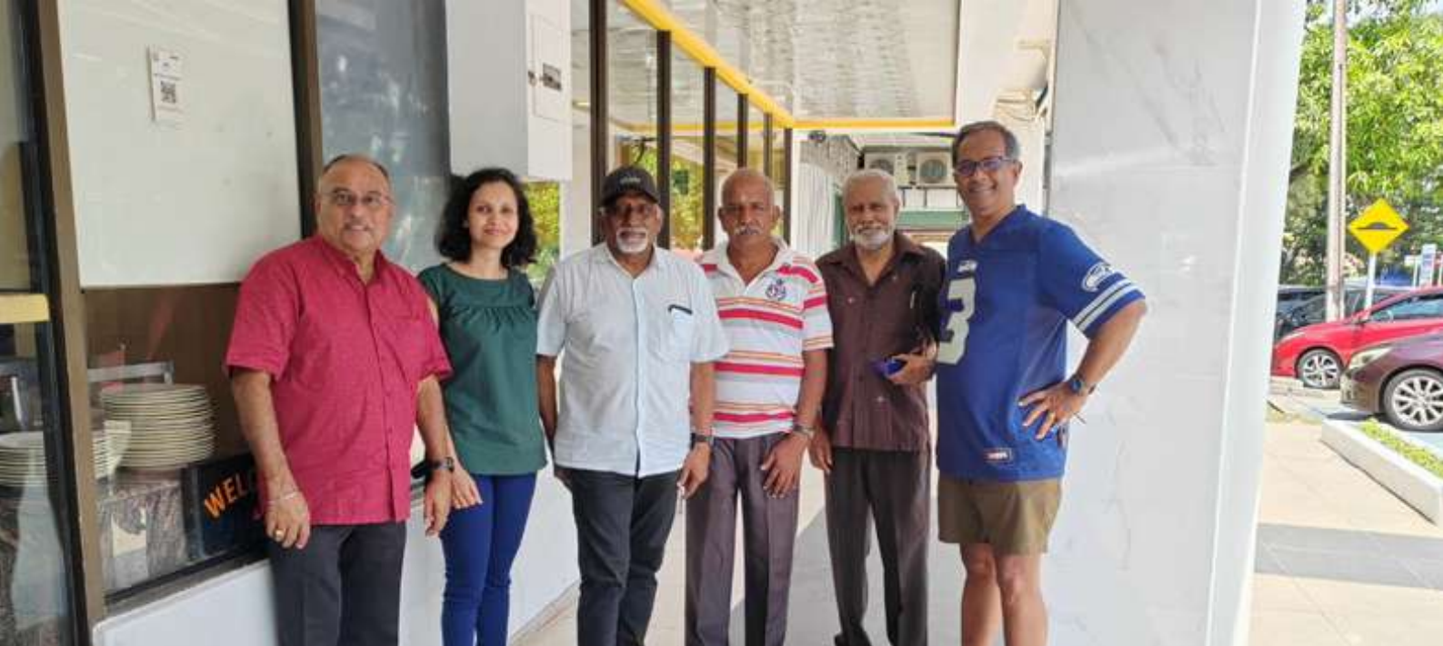
Casual Meeting - Malaysian HEAAC subchapter on 13 th May 2023