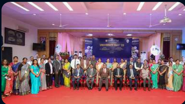
UNIVERSITY DAY '23